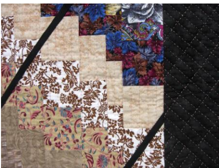
Detail image of artwork

This is the first piece in the art quilt series titled, Fractured 'Gello. This series is focused on the bargello quilt pattern, but with each artwork being fractured in different ways. The first few quilts will utilize the same fabrics as well, but with totally different outcomes. The abstract nature of the work allows it to be displayed in either a vertical or horizontal format and the piece is designed to hang in any orientation.