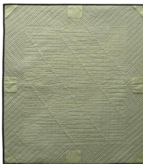
View of back of artwork